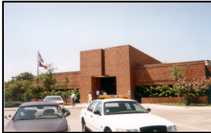
View of the entrance

This branch is a neutral red brick building, and its signage is small and difficult to read. It is a symmetrical building sited in a diagonal relationship to the corner.