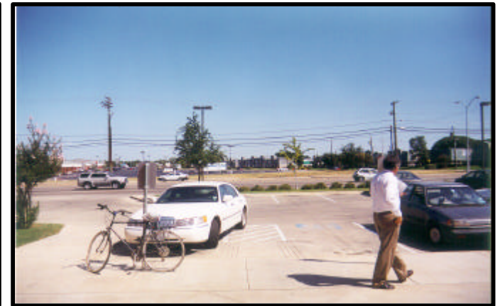
View of the parking lot