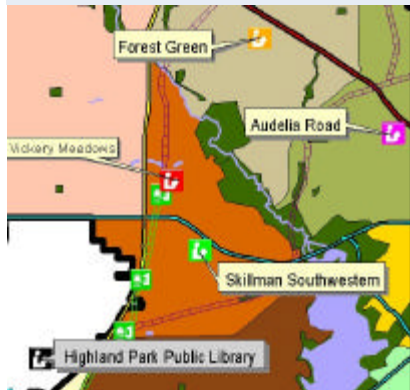
Skillman Southwestern Service Area