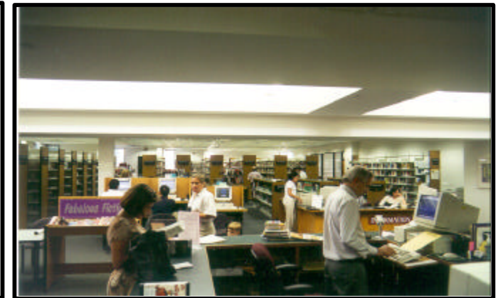
View of the reference desk and reading area