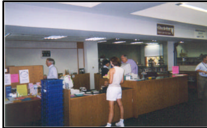
View of the circulation desk

PROJECTED OPERATING EXPENSE Skillman Southwestern Branch: $368,226