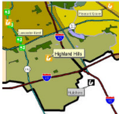
Highland Hills Service Area

ADDRESS: 3624 Simpson Stuart Road, 75241 PHONE/FAX: 214-670-0987, fx 670-0318 COUNCIL DISTRICT: Eight CURRENT FACILITY: Opened in 1980; 10,000 GSF ARCHITECT: Harper, Kemp, Clutts & Parker '98/'99 MATERIALS: 70,387 materials used COLLECTION SIZE: 46,302