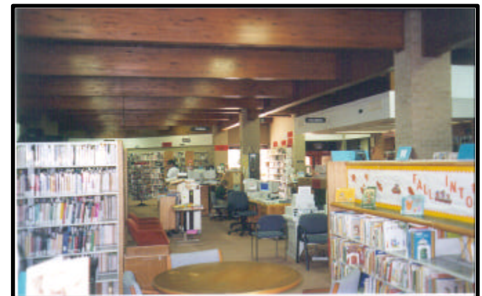
View of the reading room