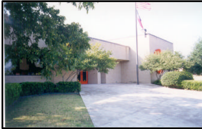
View of the entrance

This small branch is located in a low-density, mixed usage area. The interior is dark, with limited windows, and is an interior focused building.