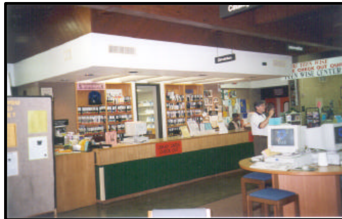
View of the circulation desk