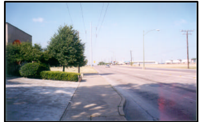
View along the street